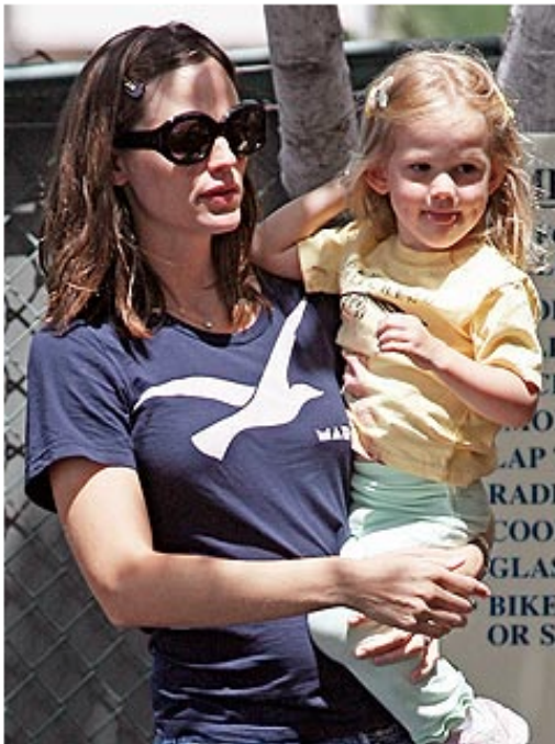
Jennifer Garner with daughter Violet